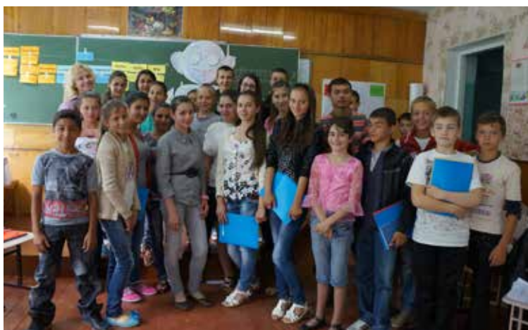
This group of school children just completed training to build awareness on the issue of child abuse and to learn solutions when they or their friends are victims of abuse.