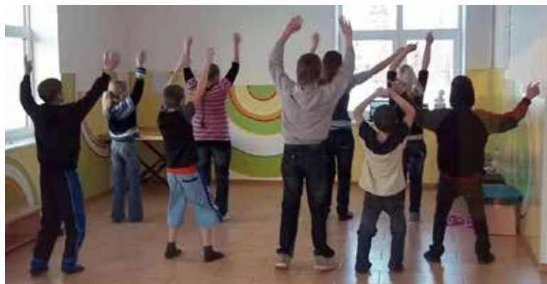
Children were encouraged to form dance groups and take roles as artists, teachers, or directors to create a theatrical-style performance.