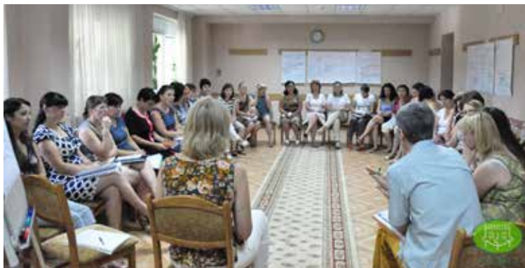
This is an image of train the trainer in action with a large group of teachers learning about the child abuse prevention curriculum developed by CRIC.

The project continues to deliver very meaningful results at a modest cost. More than 32,500 participants have been reached at a very efficient cost of $1.61 per person since the project began in 2010. The statistics provided here define the audience reached directly by teachers interacting with parents and students. Of course, there is a wider audience in each community that benefits from the awareness-building and behavioral changes generated by the core group of teachers and parents.